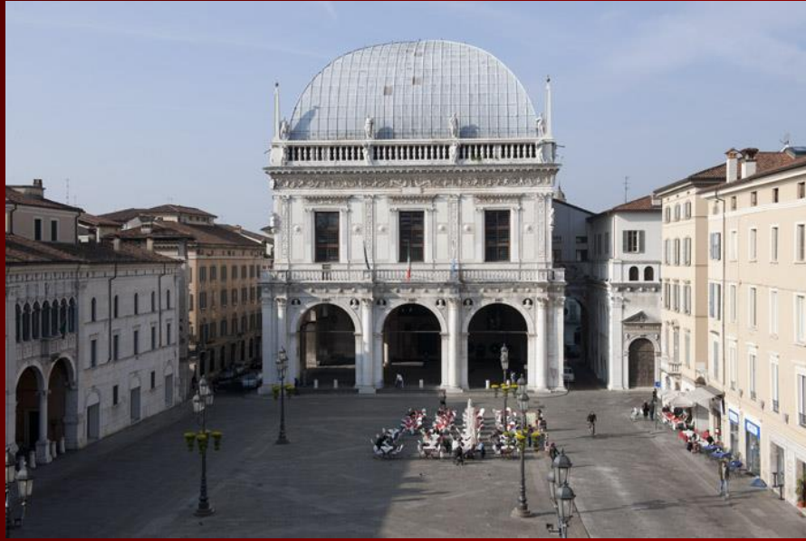
- Palazzo della Loggia -

WE ALL MET IN PIAZZA LOGGIA WHERE IN 1974 EIGHT PEOPLE DIED AND 102 WERE WOUNDED BECAUSE OF A BOMBING.